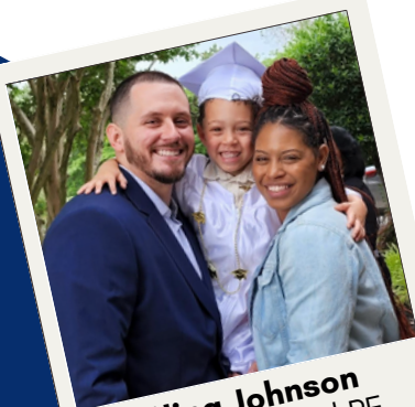
Nina Johnson Middle School PE